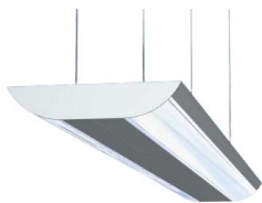
Other format options available upon request